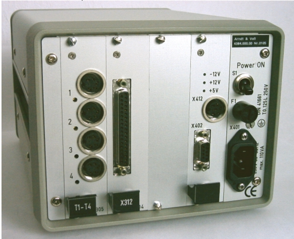
Back view 4384bck1.bmp